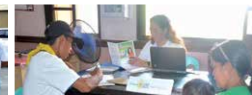
Serbisyong Palicipic on the Go