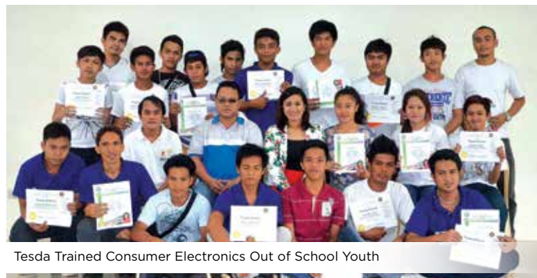
Tesda Trained Consumer Electronics Out of School Youth

W - True to her word, a "Dalaw sa Pamilyang Pagbilao" by the Mayor herself together with a medical doctor, shows her solidarity with the poor. Its intention is to alleviate the health problems of families needing health assistance, either financially or medically, providing them medicine, laboratory check-up and regular follow-up to monitor their health progress for 6 months. To include to this, is the creation of the Sweet Club, a Wellness & Lifestyle Disease Club for diabetic patients and patients with heart disease. In effect, logistics show 128 families have been visited, 749 women screened for Cervical cancer, 100 women underwent mammography, papsmear, and vaginal examination. A new building was constructed for patients sick with Tuberculosis, facilitating immediate attention and medication. To address health concerns for cancer patients, the Cervical and Breast Cancer Program has been sustained. Notwithstanding still, her administration has procured a Mobile Health Clinic, fully equipped with Dental Accessories, Medical Equipment, Medical Laboratory Equipment & Supplies. To include are Ultrasound equipment for pregnant women, Chest X-RAY / ECG Machines, with Video and Sound System paraphernalias. To top it all a