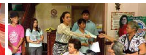
Medical Assistance to indigent families