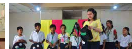
Distribution of Schoolbags to Elem. Pupils