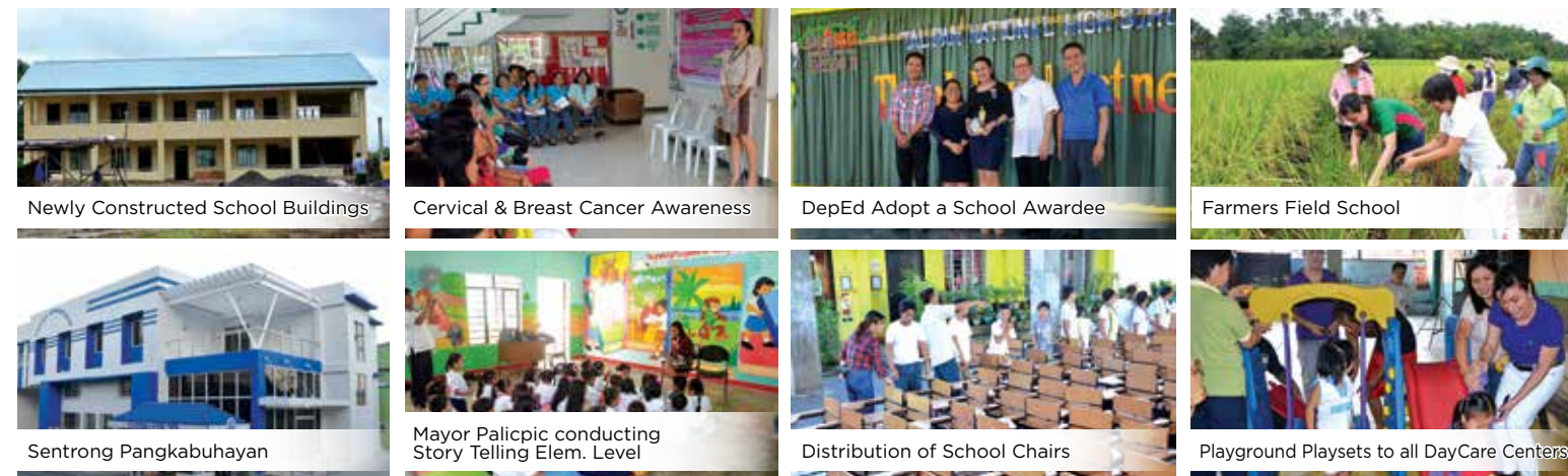
Newly Constructed School Buildings