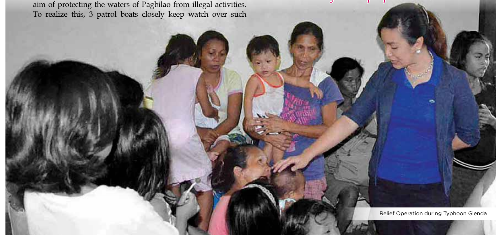
Relief Operation during Typhoon Glenda

"I vow to the public that I shall deliver JUST and EFFICIENT service, work, act and defend their rights to a PEACEFUL, SAFE and DECENT LIFE, promoting high standards of integrity for families, for local leaders and for our people as a whole."