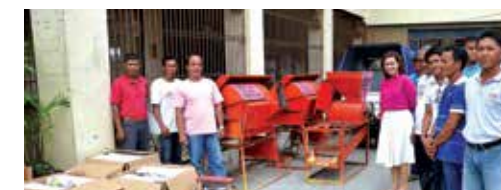
Giving of Post Harvest Equipment to farmer